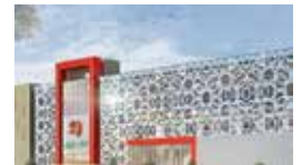
LuLu Hypermarket Dubai