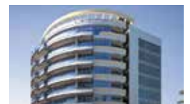
Commercial & Residential Building at Al Qusais Ind Dubai