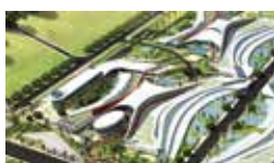
Al Watan University Ajman