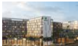
Holiday Inn & Staybridge Suites Dubai