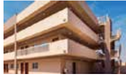
Khalifa City & Al Sader Rapid Intervention Bld. Abu Dhabi