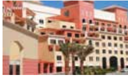
Hospitality Care Center Dubai