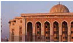
American University Sharjah Enterprises HQ