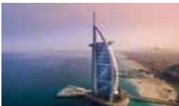
Burj Al Arab Dubai