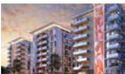
Celestia Serviced Hotel Apt at Residential City Dubai