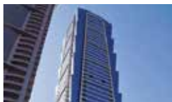
Al Batha Tower Dubai