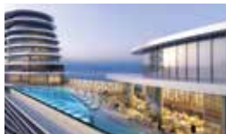
The Address Downtown Dubai