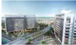
Gateway Residences Ras Al Khaimah