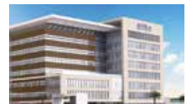
Aster Hospital Dubai