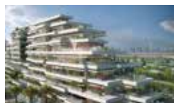
Seventh Heaven Dubai