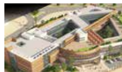
Neuro Spinal Hospital Dubai