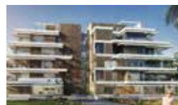
Ashjar Canopy Living Dubai