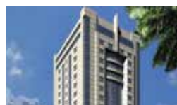
G+2P+15 Floor on Plot No. 65 Sharjah