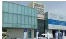
Emirates Speciality Hospital Dubai