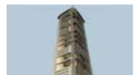
AbbcO Tower at Al Nahda Sharjah