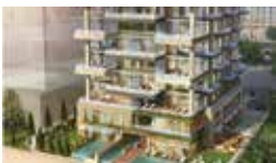
Palm Couture Residential Building Dubai