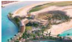
Intercontinental Hotel & Resorts Ras Al Khaimah