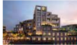
Deira Water Front Development Dubai