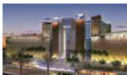
ARENO Resort Hotel Dubai