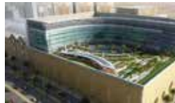
Sahara Mall Expansion Sharjah