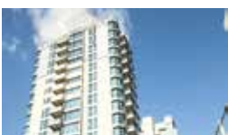
Marina Residence at Dubai Marina