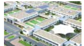
GEMS School Dubai