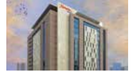
Hampton By Hilton Hotel Dubai