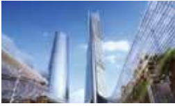
Burj 2020 Dubai