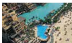
Jumeirah Beach Hotel - Phase II Dubai