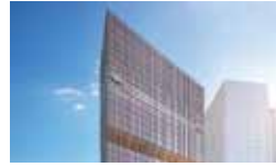
Mama Shelter Hotel & Apartment Dubai