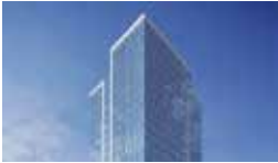
Al Huwailah Towers at Al Mirqab Qatar