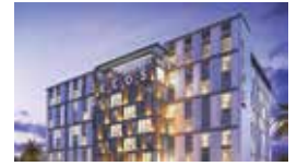
ECOS Hotel Dubai