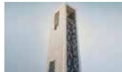
The Gate Tower Abu Dhabi