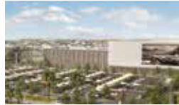
Khalifa City Mall Abu Dhabi