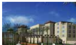
Resort Hotel, Crescent Palm Jumeriah Dubai